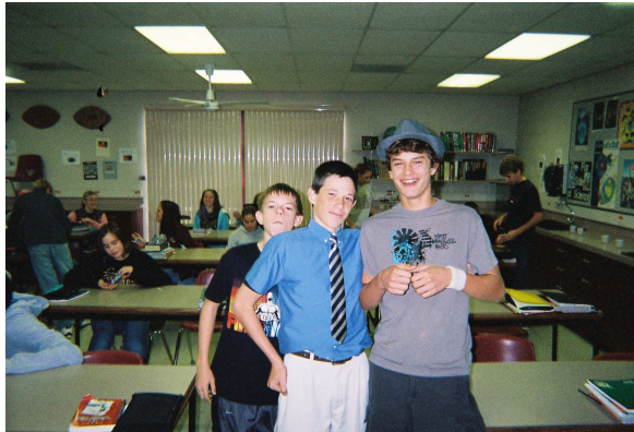
8 th Grade Students at Silver Lake Junior High School in Silver Lake, Kansas Mark 10,000 th Kansas Student Reached by KIOGA Energy Education Programs