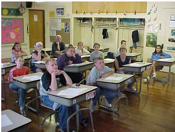
6 th Grade Students at St. Marys Grade School in St. Marys, Kansas