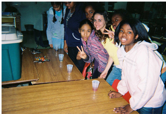
7 th Grade Students at Robinson Middle School in Topeka