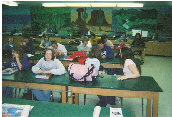
High School Science Students at Perry-Lecompton High School in Perry, Kansas